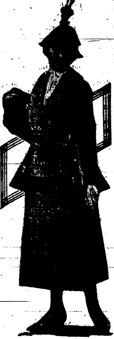
(Wear as Possible)

Shrimp Salad. Chop shrimp with celery; if large, add a little onion.