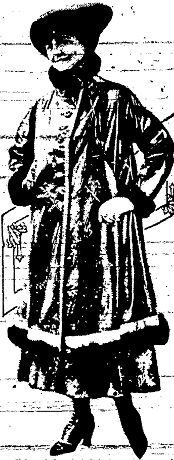
THE NEWEST NOVELTY.

Made of Glazed Leather, as Practical as Smart.