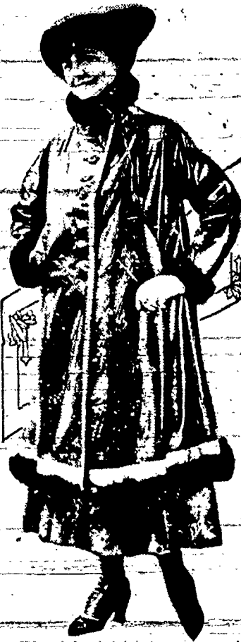
THE NEWEST NOVELTY.

Made of Glazed Leather, as Practical as Smart.