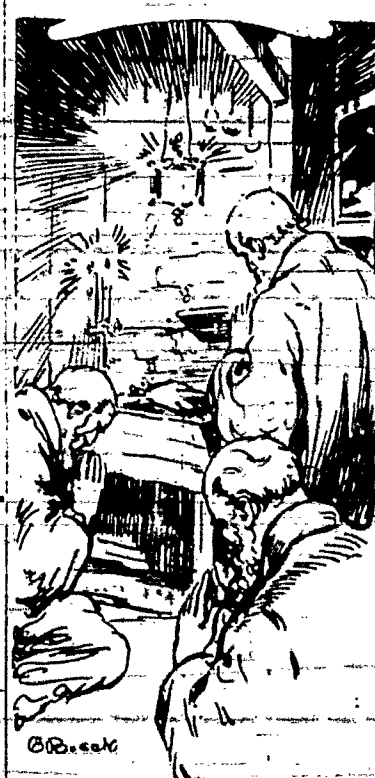
BEND LOW AND KISS THE GROUND FOR CHRIST'S BARK

Down the dark and winding stairs, slippery with the drippings of coats