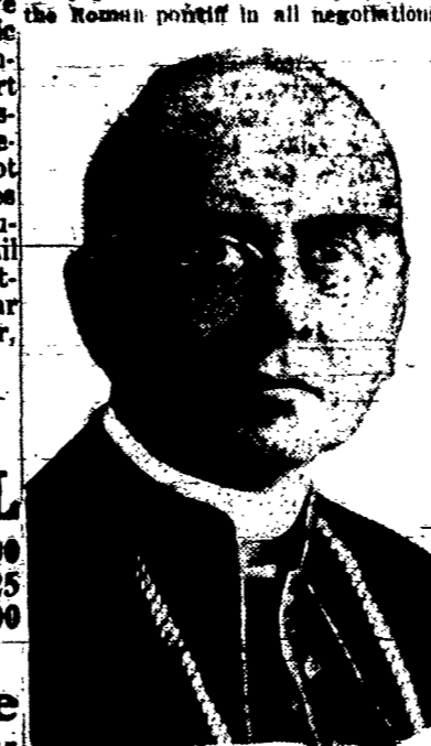
CARDINAL VON HARTMANN.

Our specialists of twenty-five years' experience treat all chronic diseases; Catarrh, asthma, bronchitis, dyspepsia, kidney, heart and liver complaints, skin diseases, throat, ear and nose; female weakness. Electric and hot air baths, with latest appliances for rheumatic and nervous troubles. Consultation free. Mail correspondence given prompt attention. Cumberland St. (near N. Y. Central Depot), Rochester, N. Y.