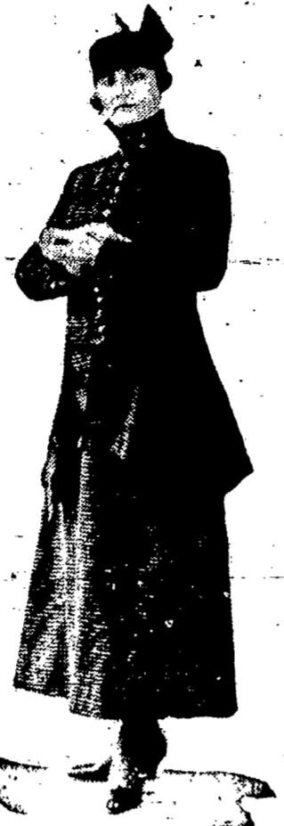
A DAPPER EFFECT.

A Chessboard Suit of Black and White Mixture.