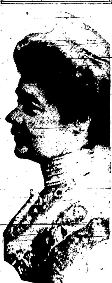
QUEEN ELEONORE OF BULGARIA.