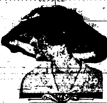
FORGET FOR AFTERNOON.

One That Admirably Fits in Between Seasons.