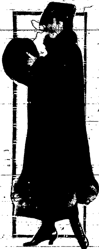
A LUXURIOUS COAT.

With warm weather and vacations still with us it seems surprising to bring in our furs. But furs and more of them are the coming note, and this handsome design of black seal, in rippling fullness and edged with skunk, suggests a new design. Please observe the smallish size of the muff.