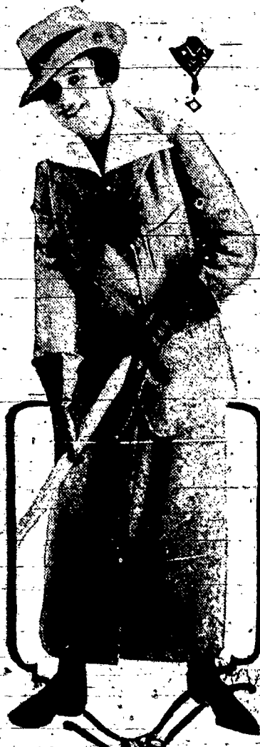
IDEAL FOR SPORTS.

A Serviceable Suit For School and Athletics.