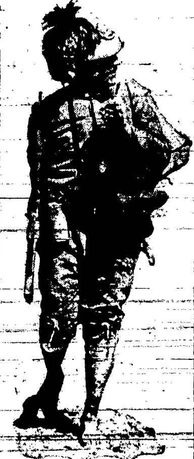
A SOLDIER OF THE BERSAGLIERI.

Of the several corps that make up the Italian army none are more famous than the bersaglieri, Italy's plumed warriors, who are regarded as the finest infantry riflemen in the world. Originally formed in 1806 by General Alessandro de la Marmora as a portion of the newly organized Sardinian army they took part in the Crimean war and acquitted themselves splendidly. The dress of the bersaglieri is of the most picturesque type, consisting of a dark blue uniform with red facings, but it is the headdress which is the soldier's greatest glory. This comprises a low crowned black slouch