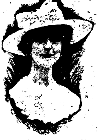
THE DUCHESS OF MARLBOROUGH. Concessa, duchess of Marlborough, like so many of England's noblewomen, is still doing her full share of relief work for soldiers.

The Duchess of Marlborough and Her Devoted Work For War Relief.