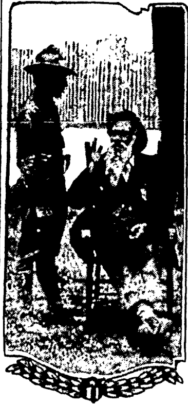
"UNTO THE CHILDREN WE TELL THE TALE"

It floats up the aisles of the village church; It springs from the statehouse dome; It kisses the breeze wherever it please, Set firm in the heart of the home.