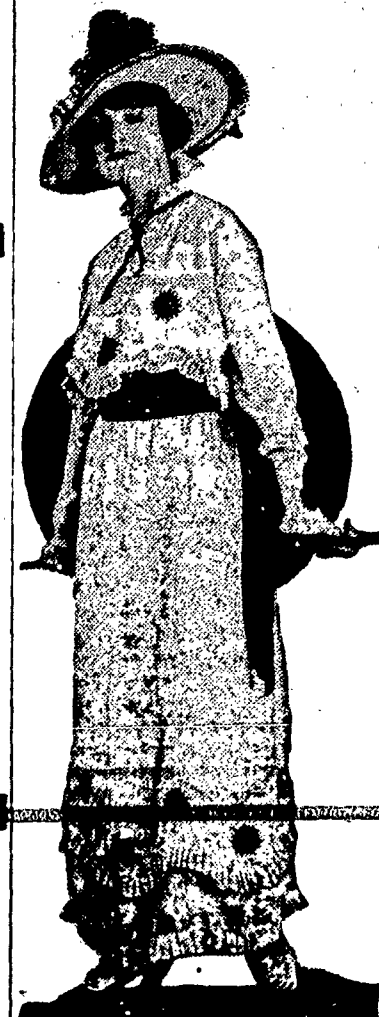
WHITE VOILE COWN.

Smart Model in Black and White For Afternoon Wear.