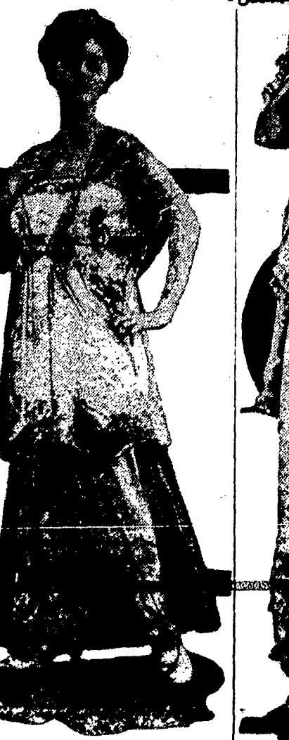
GAUEN AND SATIN ROBE

Though Somewhat Passe, the Tunio Has Many Charms