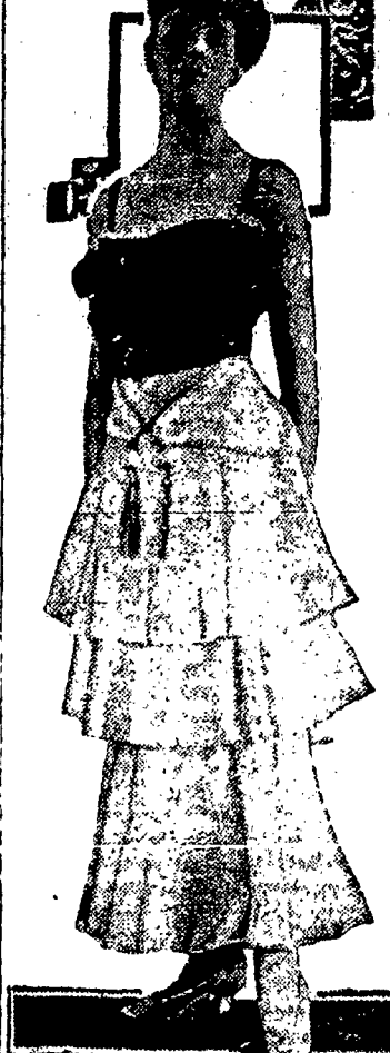
FETCHING NEW PARTY GOWN

Gown of Shimmering Silver Tissue Contrasted With Black Velvet.