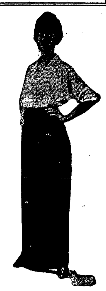
SMART PLAITED SKIRT.

Comfortable and Graceful, it is No Wonder They Are Repular.