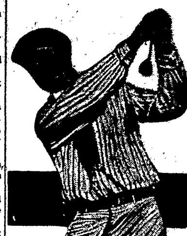
Walter C. Hagen of Rochester, N. Y., winner of the open golf championship of the United States, began his career on the links as a caddy.

Recent irrigation works have added 370,000 acres of arable land to the crop producing resources of Spain. The only two great European capitals that have never been occupied by a foreign foe are London and St. Petersburg.