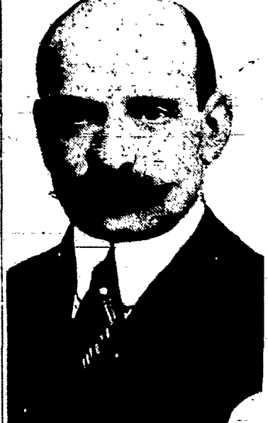
PAUL M. WARBURG

No one was able to ask King Solomon a question that he could not answer in his time. He knew much about animals, trees, plants, fruits, birds and had a great store of information.