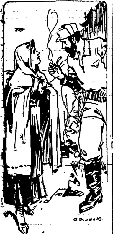
IT'S LIKE TO HAVE YOU ALL TAKE DINNER WITH US TOMORROW

S EBBS awfully forlorn to eat a Thanksgiving dinner all alone, said Milly soborly, looking over at the young fellow who sat reading a harness strap beside the blazing hearth. "I haven't the heart to get up a big dinner for just us two." "I don't see what else we can do. No neighbors to invite except old Pete Sprat, and he wouldn't come. We might feed him something by way of being neighborly." "And be turned away for our pains," the woman laughed. "You can't even go out on the high ways and hedges and gather in stragglers like the ancient host of Blithe fame. Maybe it is just as well not to have all the work of getting up a Thanksgiving dinner, for it seems to me that you look tired, Milly. What's the matter?" "Nothing, Jim, I guess I need a little seeing. I'll take a run across the hollow and be back before supper." Milly put on her cloak and went out into the crisp autumn afternoon. The woods were bare except for a few scarlike flames of red which marked the presence of an occasional gum tree. The sky was clear, cold and bright, edged with a greenish glow where the dark forests rimmed the far horizon. Not a sign of human habitation was visible, and not a sound broke the vast silence save the steady tap-tap of a woodpecker. The loneliness oppressed Milly strangely. For two years she had endured it in cheerful silence, working patiently at whatever her hand found to do in the rough little shack, which had gradually assumed