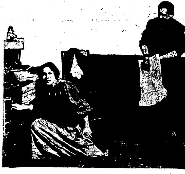
Scene from "Kindling" at The Baker

To Remove a Splinter. member in diluted alcohol or pour this ever it. Sterilize in alcohol a needle and the fingers of the hand that is to When a bachelor makes up his mind held the needle; then pick out the the latter and power removes to the former—the looking glass in which Mr. to get married all he has to do is to splinter and pour district alcohol libera facts was invasible to him.