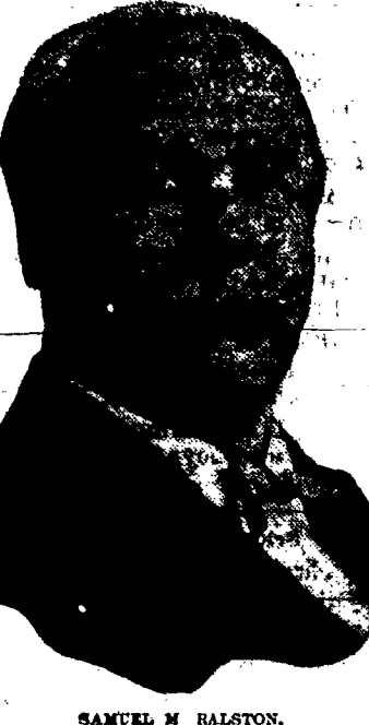
SAMUEL M. RALSTON.