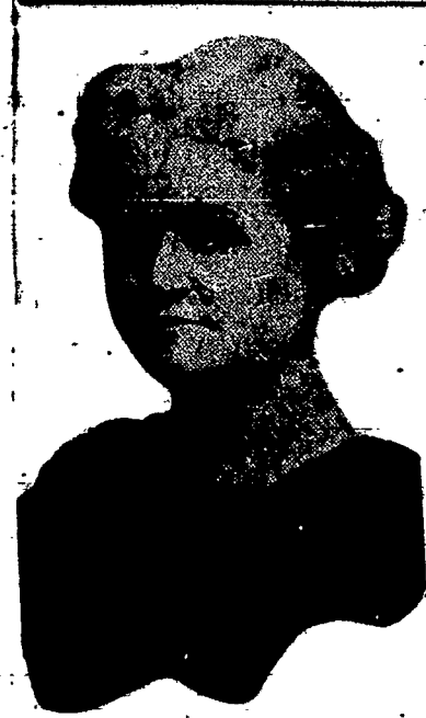
MINE HANKL GONDON CURTIE.