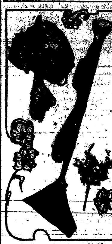
SOTHETIM FOR BARTON PART

Cigaratte Case In Parson Handle the Latest Fed