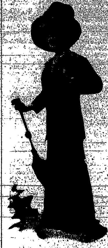
PAGO TAWATUO MITH TIVE