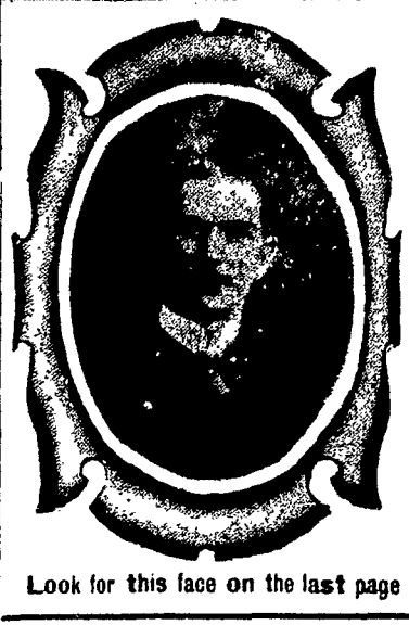
Look for this face on the last page

Sacrificing the Woman. That Caryle could contemplate with equanimity being unpraised, unmentioned and neglected all his life, that he required neither the world's praise nor its breath and could be happy and happy commensurable. That he should expect another person to share this unmentioned, paddling and other foreign condition was scarcely consistent with such lofty principles. Men may sacrifice themselves, if they please, to imagined high duties and ambitions, but they have no right to marry wives and sacrifice them.—Exchange.