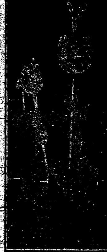
Simple Description For Children's Entertainment

Quick Description For Children's Entertainment