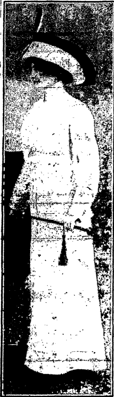
SPRING TAILORED GOWN

If you contemplate ordering a new street dress consider well the features of the new tailored frocks that are being shown by those who cater to advanced taste in fashion. Notice the shortness of the coats, many of which are sloped from the front after the manner of a cutaway coat. Large buttons—two or three, perhaps five—will keep the front of the coat closed, while collars are more ample than ever. The illustration shows a typical tailored gown of white cloth finished with bands of silk braid.