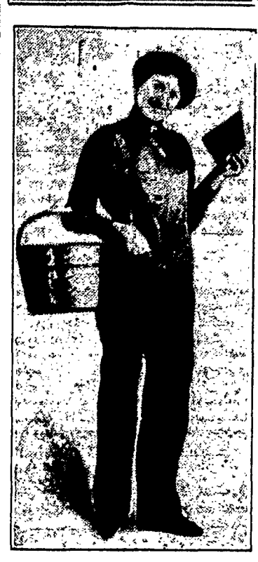
WEARING THE OVERALLS.

The up to date housewife has disby skirts, bence the fact that in many cases she has taken to wearing one or the other of these articles of men's. When you named your little girl did apparel when her duties call for house