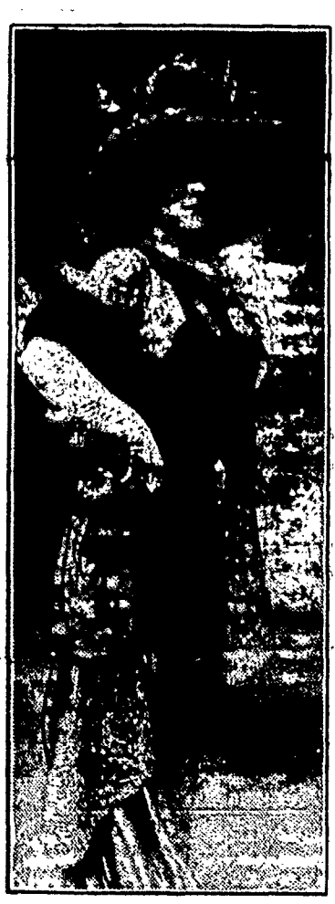
HOW MILADY WEARS HER POSIES.

The Lure of Artificial Roses. The somber costumes of the winter