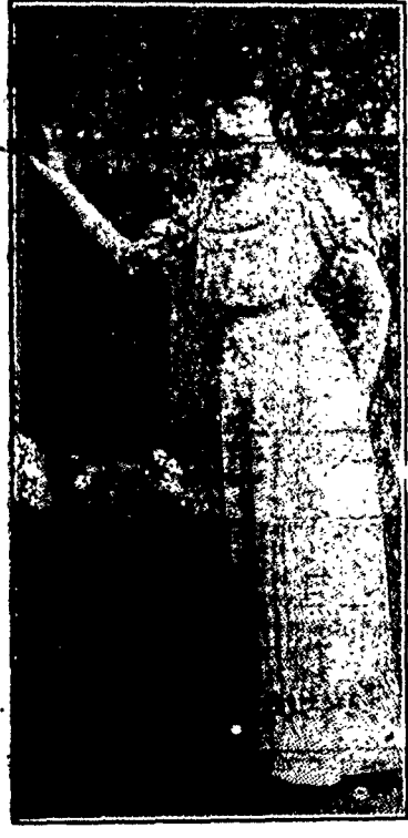
IN SPOTTED TULLE.

Evening frocks for young girls are very simple and dainty this season, backward, taking a step of each stroke, cleaning should be done with some rainy day, and many quaint and old world effects. Every step successfully mounted means and warm water to which sait has are turned out by smart dressmakers The frock seen in