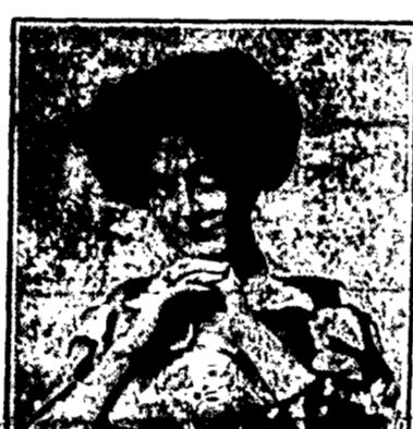
THE CHANTICLEER DRESSING JACKET.

When is a polo coat not a polo coat? That is the question which may be answered in the same breath—when you see it worn by smart girls and women as an outing wrap, for motor ing, on the tennis court as a blanket for the feminine champion as she stands to receive the congratulations of her friends after the game these cold autumn days.