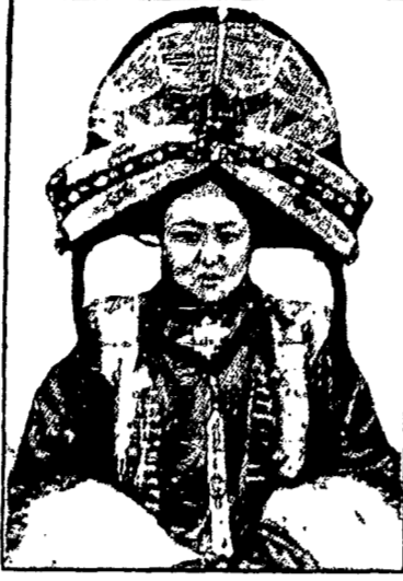
THE PAGON HEADDRESS WORN IN TIBET.

Tibet Headdress Might Be Adapted to American Styles.