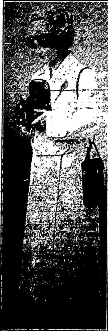
THE NEW POLO COAT.

It's the Smart Outing Wrap of the Season.