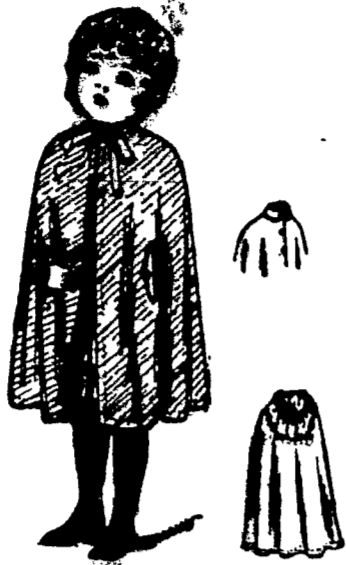
CAPE FOR SMALL TOYS

More fur will be used than usual as a trimming this season on gowns, coats and hats alike. It combines especially well with velvet, and, as this will be the leading material for dressy street frocks, most of these will be decked with strips or ornaments on cuffs, neck, girle and hem or mark-