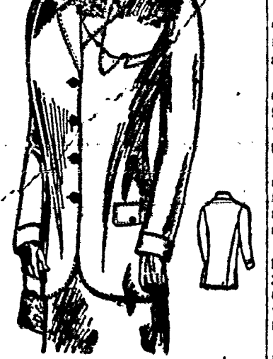
AN AUTUMN COAT with fur bands and fur collars and cuffs are to be extremely fashionable this season.

A Parisian fancy for the black satin coat suit with collar and revers of coral satin. It is a mode that, it is said, will hold over into winter styles. Suits of velvet or velvet trimmed