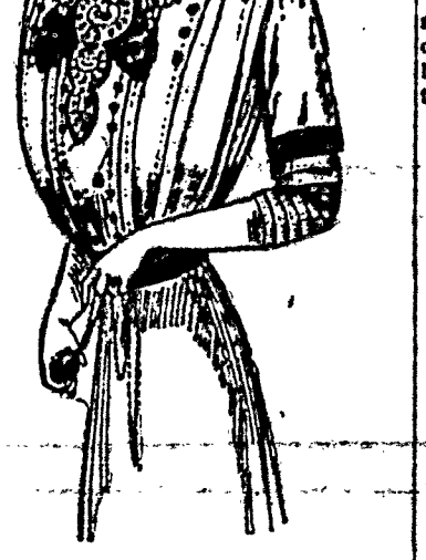
WAIST WITH DOUBLE SLEEVES. In construction. Coat sleeves are also tight and small, with no shoulder fullness.

The diction as to sleeves is that they shall be small and tight. Many are short, ending above the elbow, though the smartest extend below the elbow and are finished with a lace cuff or underleeves and are rather elaborate