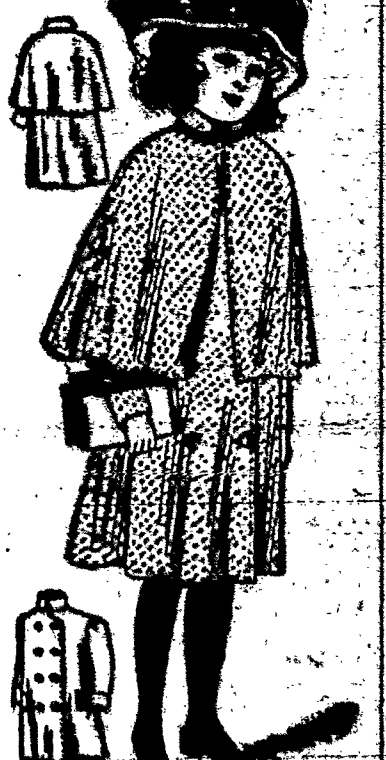
A FINE SCOTCH COAT. scarf of black satin lined with color must wear a black satin hat lined with the same shade as the lining of the scarf.

To be quite up to date the woman who wears one of the new double