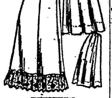
UNDERPETTICOAT. dered with plain silk. These make a fine finish for neck and sleeves of a simple silk waist.

Collar and cuffs in silk are shown in Persian designs. They are plaited and lie flat around the neck and are bordered with plain silk. These make a fine finish for neck and sleeves of a simple silk waist.