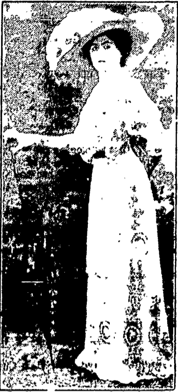
IN LACE AND PROPER

It's a Cool and Dainty Creation For Midsummer