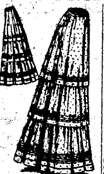
TUCKED BODICULAR SKIRT.