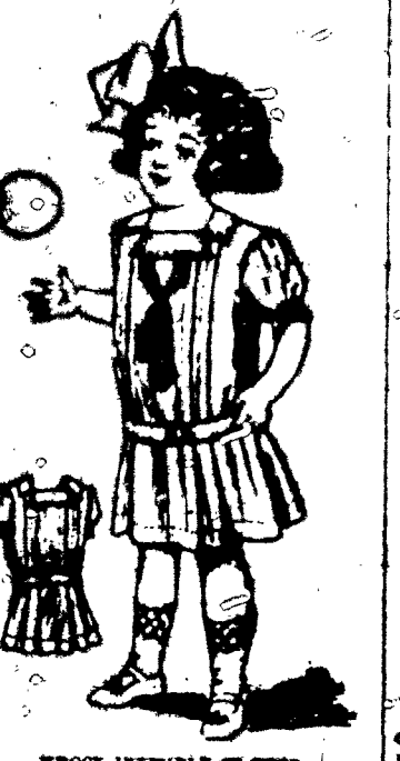
FROCK INTRICATELY CLOTHED.

Little Acquaintance of Brown Tulle Made For Sportswomen. Short waist coats are so in vogue in all sorts of designs. They generally come in sets of three pairs, two for the outer and one for the inevitable skirt.