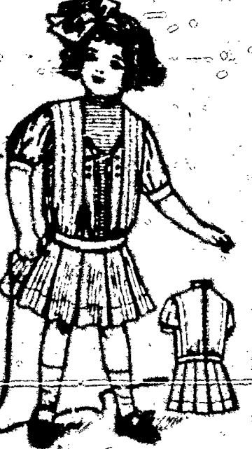
SIMPLE ONE-Piece DRESS.

Styles in the New Season—The "Chanteclair" Stationery. While sleeves are short, it is considered better to cover the lower part of the arm with a tight under-sleeve of transparent material.