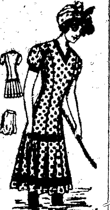
PRINCESS BATHING SUIT.

The Surplice Bodice Seen on Many French Fashions This Year. Simplified lines are used on a large percentage of the French dresses, the V-shaped opening being low and fitted in more or less, according to the character of the frock.