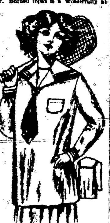
THE DRESSING ROOM.

Mary Garden Performs the Latest Jewel Shades in Silk Fabric. The newest fashion is the Mary Garden. It seems to be a mingling of all the sweet smelling flowers of the garden—a coat of white-rose, a branch of white lilac and lily of the valley, with a delicate odor of apple blossoms.