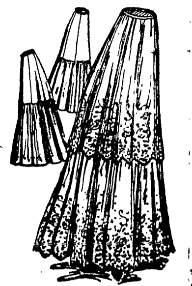
TWO FLOUNCHED SKIRT.

The black patent leather belt and the belt of colored leather, gaiter silk or velvet combined with patent leather are evidently to be much worn.