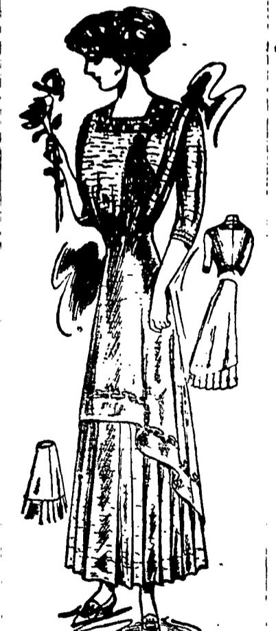
SMART DRESS OF PONGEE.

Pockets, Pockets Everywhere, and Not One Really to Us.