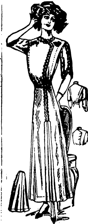
A NEW EFFECT IN LINES.

We transcend Fashion Rules This Season—Individuality in Clothes.