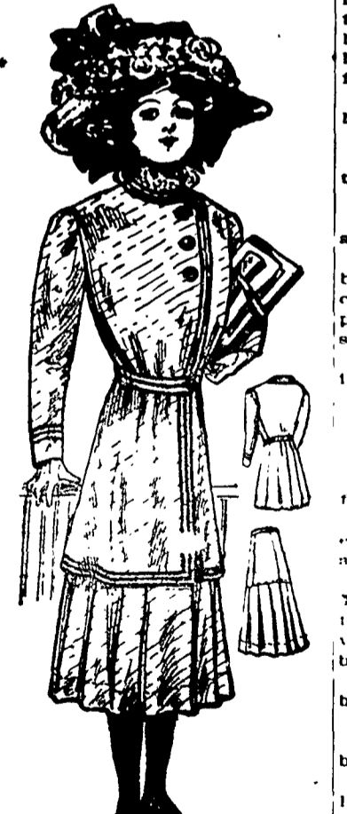
GIRLS' SUIT OF BLUE SERGE.

Study the Lines of Your Head Before Wearing the New Coiffure.