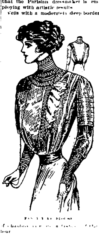
UP TO THE MINUTE STYLES. SNAPSHOTS OF THE MODES.

In both afternoon and evening frocks the new skirt suggesting the shaped flounce model is seen. This model is a pretty one both for a long and a short skirt, and two kinds of materials are frequently combined. Beige and black is a combination that the Parisian dress-maker is employing with artistic results. Veils with a moderately deep border