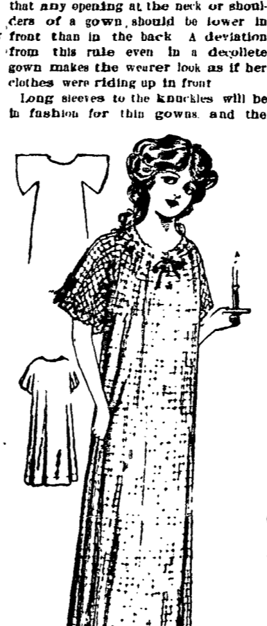
THE GIRL APPEARS ON ALL KINDS OF COSTUMES.

Even on princess gowns the wide gir die is seen, sometimes in the guise of a pinafore bib or in a deep point far below the waist line. Combination skirt and corset covers are to be worn as persistently as ever. Too many women ignore the fact that any opening at the neck or shoulders of a gown should be lower in front than in the back. A deviation from this rule even in a decolette gown makes the wearer look as if her clothes were riding up in front. Long sleeves to the knuckles will be in fashion for thin gowns and the