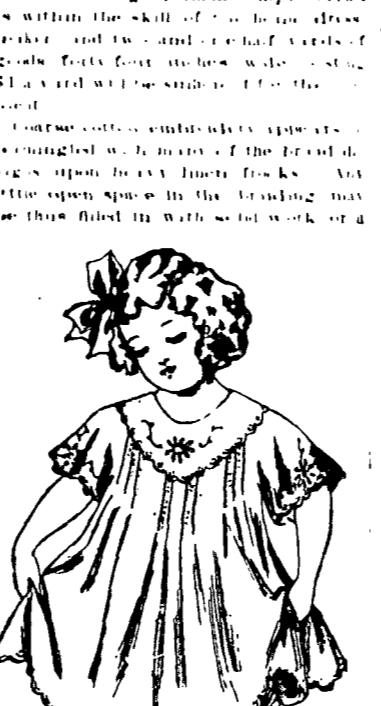
FADS FOR THE FAIR.

Nothing is sweeter in spring wraps for small maidens than the box coat of black and white striped fabric. The fashioning of these simple styles is within the skill of a home dress maker, and the result is a coat of $1.50 and will be a very good one.