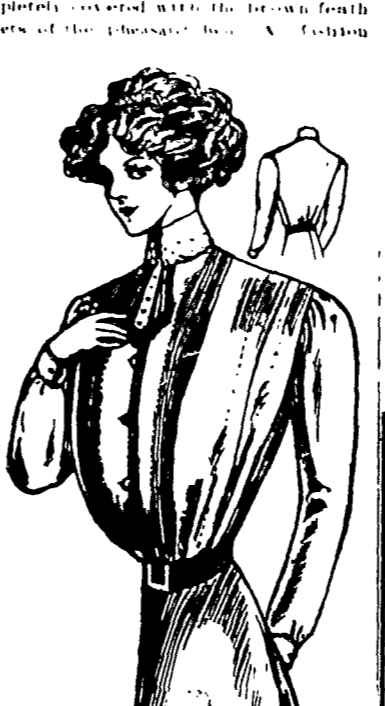
FRIBBLES OF FASHION.

"Chanticleer" veiling is the newest thing at the sewing counters. It comes in two toned colorings that copy the shadings in the peacock's plumage. The craze for imitations of the baron's crest extends to buttons and there is an exciting competition between the makers of the buttons of the pheasant's crest.