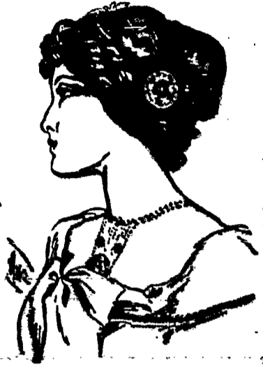
CLASSIC TOILET MODERNIZED

Greek and Roman fashions appear in the hair ornaments of today, but with a difference. Hairdressers hold that few American faces can stand the severity of purely classic adornments. A woman may be ever so charming, but unless she has Juno's perfect features she had better not assume Juno's fillet. Fillets and wreaths, though, American women will have, and some go so far as to crown their pompadours with two and even three bands. But they are bands such as the maids of Athens never had—fillets with attachments of spangled, sequined and jeweled wings and cabochons.