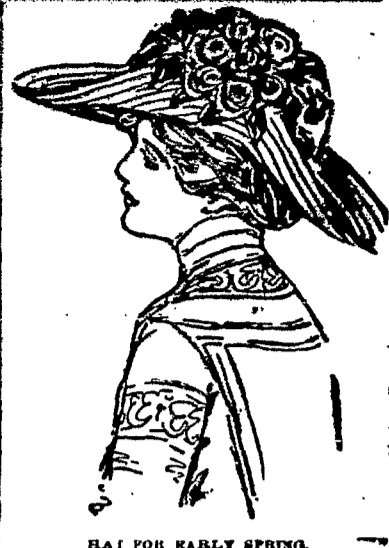
HAT FOR EARLY SPRING.