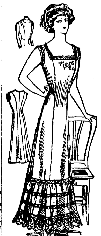
THE USEFUL PRINCESS SLIP.

These are some indications that the summer will be a linen season. corduroy