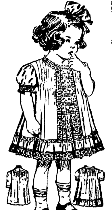
FROCK FOR SMALL TOTS

Hand Embroidery the Latest Touch on the Smartest Spring Lingerie. Nearly all the new underlinen is trimmed with handmade embroidery, and very pretty effects are thus gained. Little and good seems to be the trimming rule of the new lingerie, no matter what the decoration used. Baby ribbon for threading through lingerie has gone out. Inch wide soft satin ribbon has taken its place. Many of the smartest corset covers have sleeves that come to the elbow.