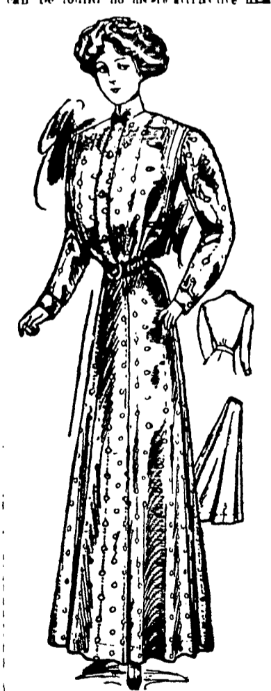
NEW SHEET WAIST DRESS.

The kimono blouse is a great favorite. It is of chiffon, sold de nylon or pongee materials plain and embroidered, and are trimmed with just a touch of broderie stitch. This is done on a frame in a darning stitch. The design is formed by squares of color. For a dainty home made frock there can be found no more attractive ma-