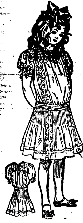
A DAINY LITTLE FROCK.