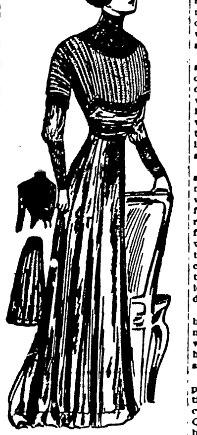
ONE OF THE SPRING MODEL GOWNS.

A novelty in sleeves shows the shoulder seams and sleeve cut all in one.