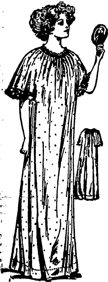
A SIMPLE NIGHTGOWN.