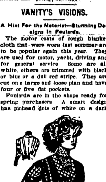
A SIMPLE DRESS OF LINEN.

VOGUE POINTS. Colored Blouses Are Going to Be Smart the Coming Summer. Those who are making lingerie blouses should pay attention to the colored ones that match the coat suit in coloring, but are made of wash material. They are severely simple, consisting of the usual side tucks with a full down the front. The sleeves are moderately close fitting and have a three inch turnback cuff. The fabrics used are dotted Swiss, voile, nain, marquisette and grenadine. A smart suit of heavy linen crease has a gored skirt and hip length coat. The coat has a collarless neck, embroidered in self color and closing with