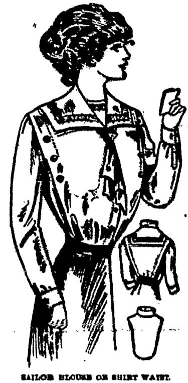
SAILOR BLOUSE OR SHIRT WAIST.

This May Manton pattern is cut for girls of fourteen and sixteen years of age. Send 10 cents to this office, giving number, skirt 678 and blouse 682, and they will be promptly forwarded to you by mail. If in haste send an additional two cent stamp for letter postage, which insures more prompt delivery.