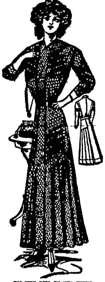
FOR THE GIRL IN HER TEENS.

MODISTIC MATTERS. Titian Frocks of Black Satin the Latest For Small Folk. The little folk with their long coats and dresses of black satin with black lace collars look like reproductions of Titian's canvases. Indoors they wear with such costume sashes of rose or other bright color and hair bows of the same. The advance modes for summer crowns show the trunk as being very popular. For instance, anything from a twelve and a half cent gingham to a