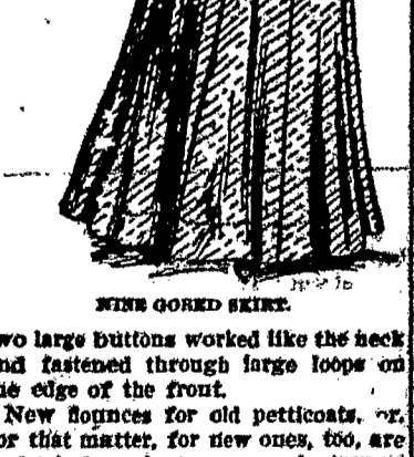
THIS MAY MANTON PATTERN IS CUT IN SIZES FROM 24 TO 48 INCHES BUST MEASURE.

Two large buttons worked like the neck and fastened through large loops on the edge of the front. New gorges for old petticoats, or, for that matter, for new ones, too, are to be had ready to sew on in several styles and materials. The gorges are shirred, plaited or of plain circular shape. The gorges have drawstrings that adjust them to the width of the skirt. This nine gored skirt is one of the latest designs of the spring walking skirt. It is also an excellent pattern for white and colored separate skirts for summer wear. It can be either laid in inverted plaits in the back or finished in habit style. JUDIC CHOLLET.