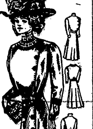
MINIEM RUSIAN BLOUSE COAT.

Camorote of Fish. Put half a pound of cooked white fish and add a slice of bread which has been soaked in a little milk. Heat well together and put through a chaffing machine, then through a sieve