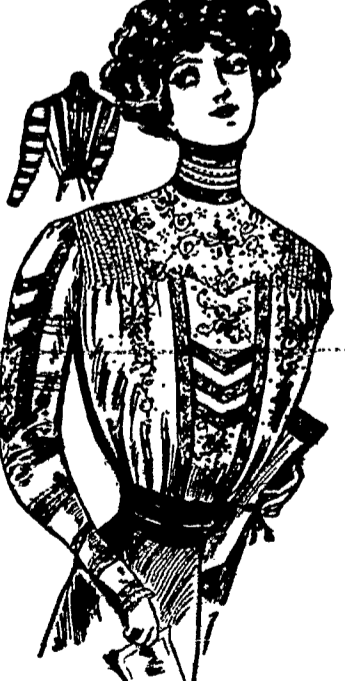
FOR THE LINGERIE BLOUSE.

DOINGS OF FASHIONDOM. The New Fad in Handkerchiefs—Return of the Short Sleeve. One can find the bargains in extremely pretty handkerchiefs included in the white sales at all department stores. A new fancy is for the all over embroidered design. These come in plaids and checks in all white and white embroidered in colors. The return of the short sleeve just now is one of the surprises of the mode, but that it is well established is guaranteed by its prevalence in both dressy gowns and coats. There is the seven-eighths length, near the lower wrist; three-quarters, halfway between wrist and elbow, and half length, at the elbow and even above that point. Many of the linen coats of an elaborate nature have three-quarters or seven-eighths sleeves. The lingerie blouse that is made with a square yoke is one of the latest