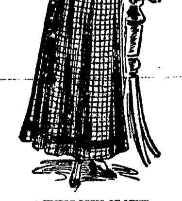
THIS MAY MANTON PATTERN IS CUT IN SIZES FROM 24 TO 48 INCHES BUST MEASURE.

two large buttons worked like the neck and fastened through large loops on the edge of the front. New gorges for old petticoats, or, for that matter, for new ones, too, are to be had ready to sew on in several styles and materials. The gorges are shirred, plaited or of plain circular shape. The gorges have drawstrings that adjust them to the width of the skirt. This nine gored skirt is one of the latest designs of the spring walking skirt. It is also an excellent pattern for white and colored separate skirts for summer wear. It can be either laid in inverted plaits in the back or finished in habit style. JUDIC CHOLLET.