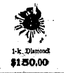
1-k Diamond $150.00