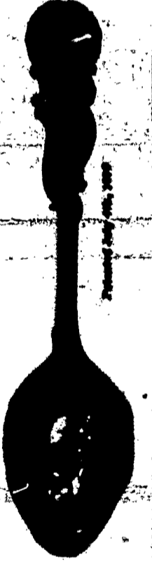
Free—Handsome Spoon with every purchase of $3.50 or more, after 8 P. M.