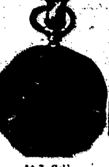
14-k Gold $20.00

The early shopper will find complete stock of shoes from which you can have any ordering done that is necessary, while the later ones find that shoes and a broken stock. BUY NOW and let us help you purchase till you are ready for them. Have open evenings until Christmas.