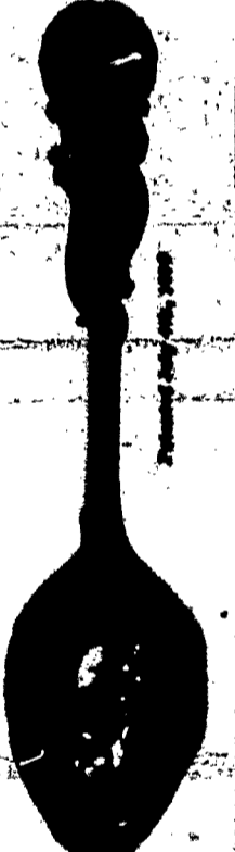
Free—Handsome Silver Spoon with every purchase of $3.50 or more, after 8 P. M.