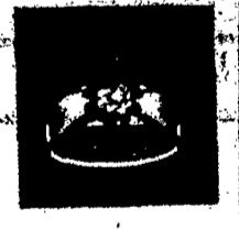
1-2-k Diamond Ring $50.00