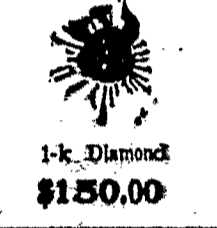
1-k Diamond $150.00