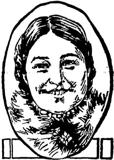
Columbia, the Eskimo Girl.

The prize was a valuable piece of Seattle property, a lot in the residence