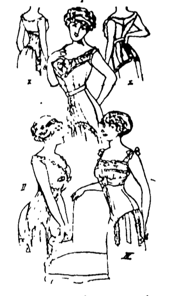
THE NEW "GRACE" CORSETS NO. 1 WITH ONLY TWO BONES AND A FLEXIBLE STEEL FRONT

What had scared the great dressmakers? Paris business was being threatened by fashionable people. Queen Alexandra of England influenced by the movement in Scandinavian countries has joined hands with the London Times in favor of the creation of a corsetless nation. A new style for women in Paris, Queen Helene and Dowager Queen Marguerite have formed a committee of eminent Italian artists with the fashionable Haldim at its head. It is these fashionable movements and a few of the new Parisian grace corsets we describe.