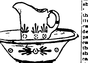
Soft Blue Innings for Summer Cottage.

Soft Blue Innings for Summer Cottage. You know what stenciling is. A design is cut through a piece of cardboard or other similar material, forming the stencil. This is placed on the article to be decorated and coloring matter—paint or stain or other such substance—is put on with a brush. Of course, it reaches the article to be decorated only through the cut design, leaving that design neat and evenly on the cloth or paper whatever is being ornamented.