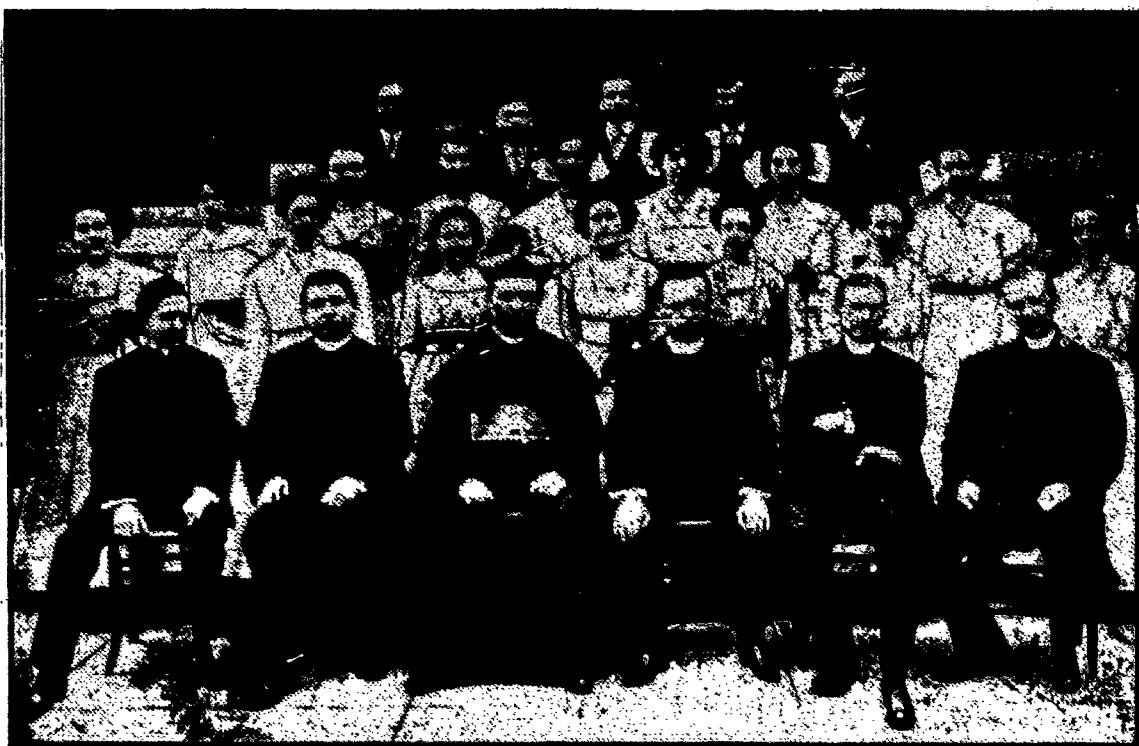
Graduating Class Commercial Department Cathedral High School

Sash, Doors, Blinds, Interior Wood Work Window and Door Frames, Stair Builders, Mouldings, Sewing and Turning, Plate and Sheet Glass. Corner Water and River Streets Rochester, N. Y.