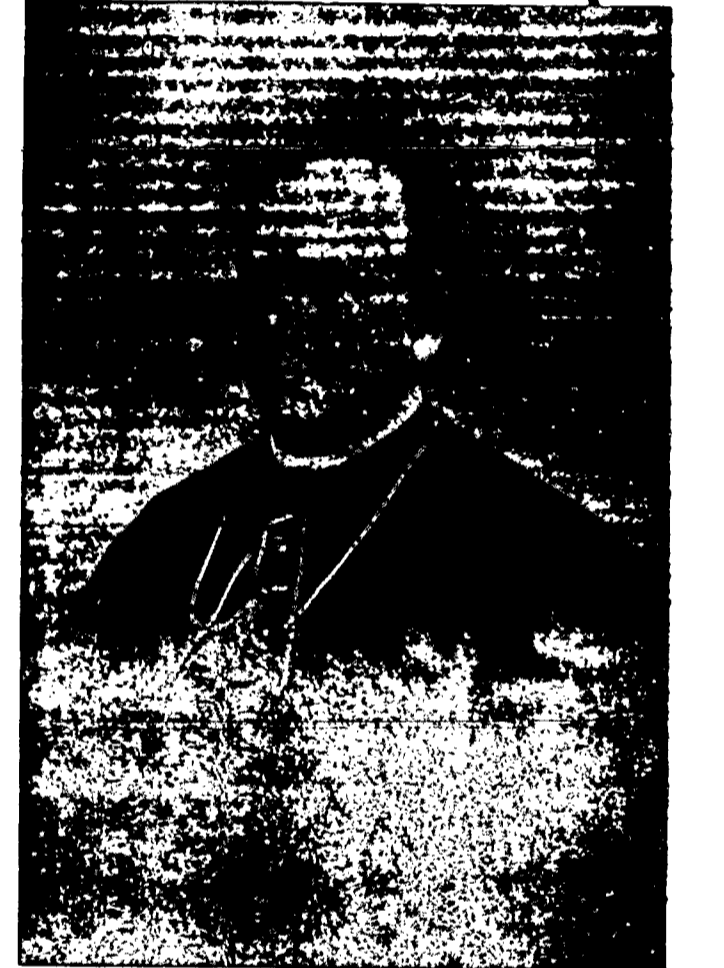
Taken Thirty Years Ago