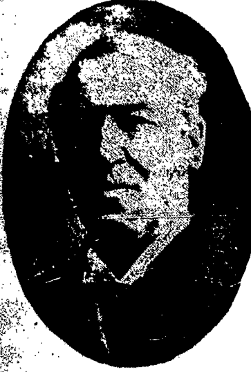
JAMES BRECK PERKINS Republican, Renominated for Representative in Congress for the Thirty-second District