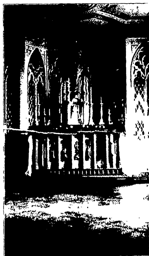
Interior Private Chapel in Palace of Bishop of Ottawa, Canada. Parquetry Flooring laid by our Agents. The chapel floor was laid in parquetry squares with a fleur-de-lis centre piece and the border was a maltese cross design.

We can supply appropriate designs in Wood Mosaics to conform to any scheme desired.