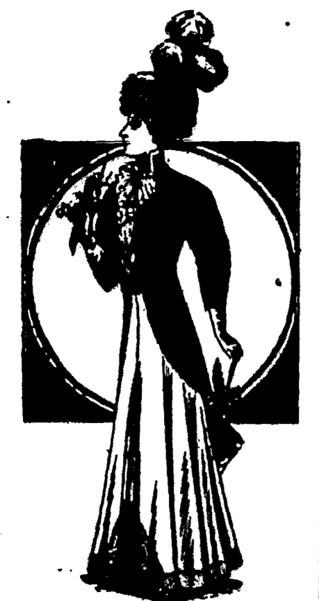
FROCK IN SILK AND VOILE.

blue silk attached top and bottom with soutache braid. The bodice is formed principally of blue chiffon cloth with a yoke of lace bordered with tucked bands of crepe de Chine.