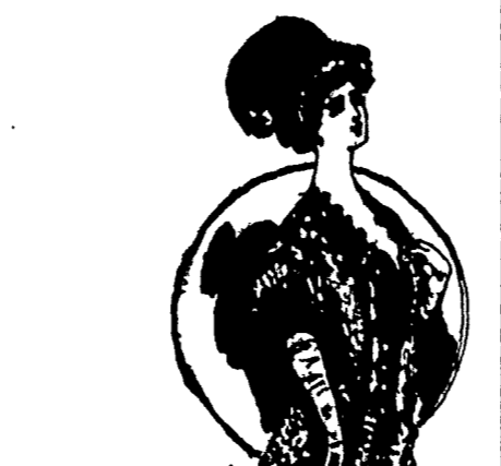
A COAT FOR PARTIES.

A Coat for Parties. This delightful coat can be carried out in any of the fashionable all-over laces or in coarse flax net, into which may be woven a design with heavy silk floss.