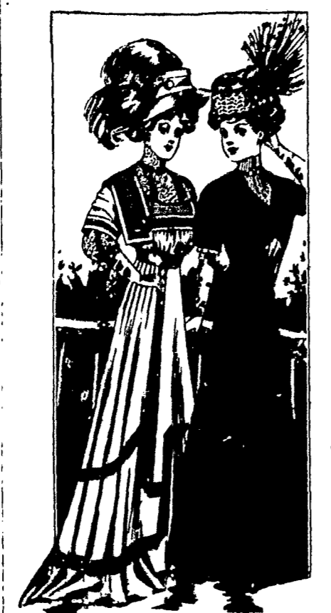
FROCKS FOR WEDDINGS

groups and the soft silk material, is glorified with a trimming of finest lace darned with Oriental silks in odd designs.