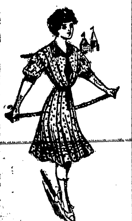
A MODE FOR THE SEASHORE.

of stitching about the hem and lower front panel. The stitching, which is pyramidal at the front, is done in the darker tone produced in the coat. Although it is loose-fitting, the coat follows the lines of the figure about the sides, and at the front it is drawn into closely stitched revers that extend to the waistline.