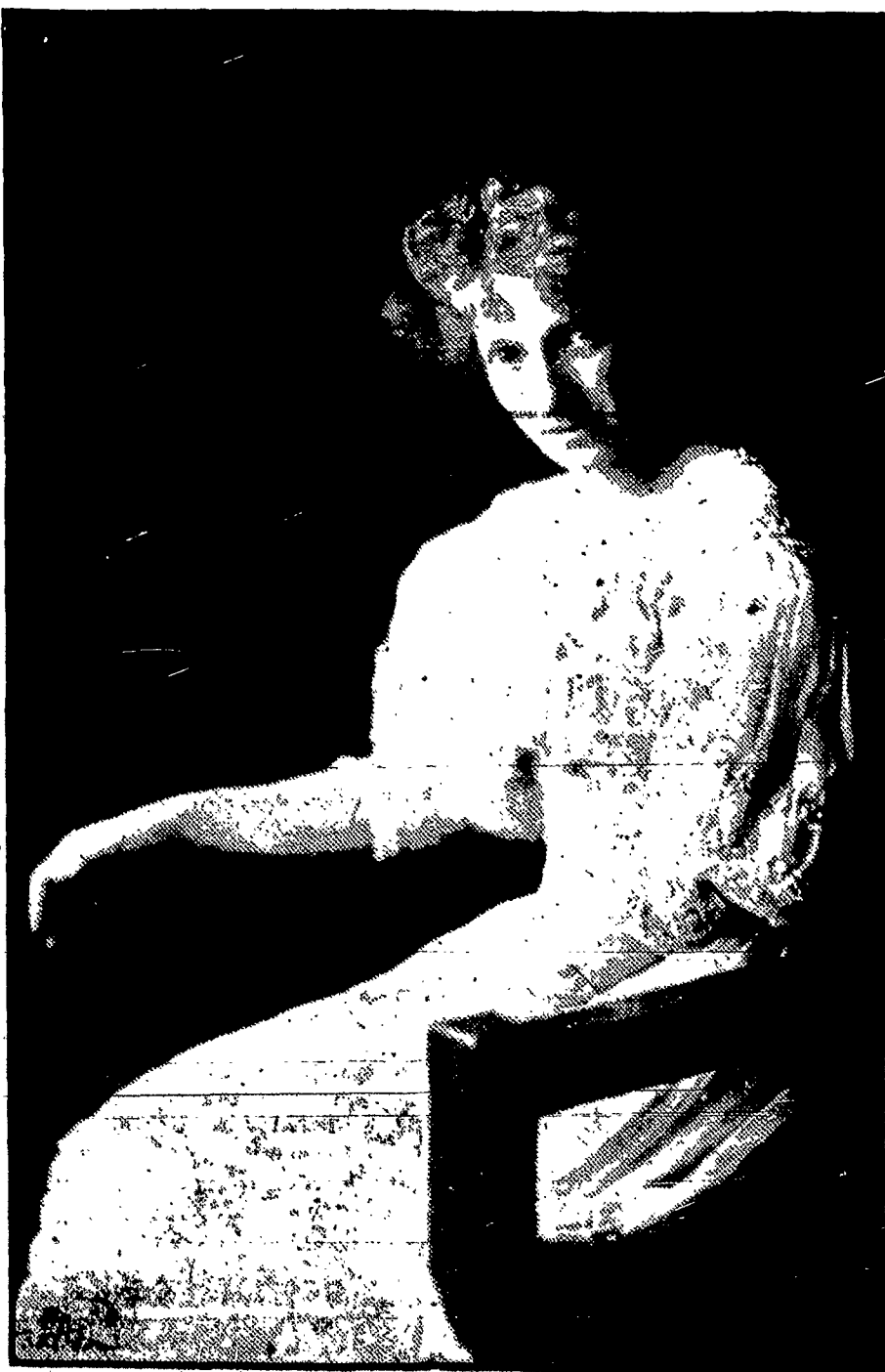
Miss Jessie Bonstelle

We are always glad to extend deserved credit to anyone in "the old fashioned way."