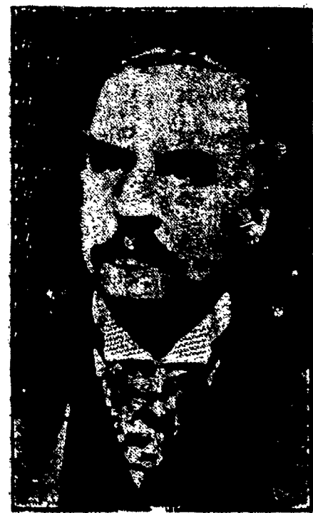
J. P. MORGAN.

A deep hush fell upon the assembly, when a voice simulating Amer-