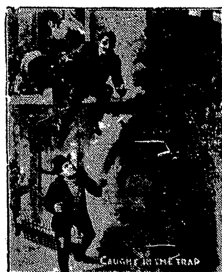
Scene from "Since Nellie Went Away". A. H. Woods' production of Owen Davis' melodrama "Since Nellie Went Away".

"Nellie Went Away" will open at the National on Monday for three nights and two matinees. Life's two master passions, love and jealousy furnish the main theme around which is woven a story of intense human interest. The four acts are divided into twelve scenes, thus providing an opportunity for a display of some of the most marvelous mechanical devices ever seen upon the stage. No expense has been spared and accuracy of the most minute details has been aimed at and secured.