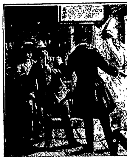
Scene from "Chinatown Charlie" is made necessary in order that the story of the play shall thoroughly emphasize the possibility of complete reformation on the part of the victim, who finds a sure cure in the power of a pure girl's honest love.