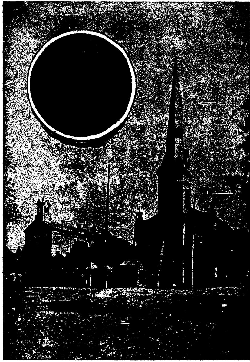
Ss. Peter and Paul's Church and Rector