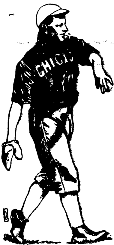
NICK ALTROCK IN ACTION.

Nick Altrock is widely believed to be in line for the premier pitching honors of the American league for this season.