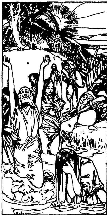
AS THE SUN RISES OVER MOAB A STRANGE SPECTACLE APPEARS.

The pilgrims, disrobing in great haste and rushing down the banks, plunge into the river in an undisturbable mass. The garments they wear are the white robes sanctified