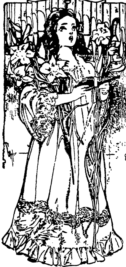
BEHOLD HER ROBED IN FILMY WHITE.

Once, in a mossy garden old, The angel of the flowers Walked in the silver mist of dawn And watered it with showers. He saw an Easter lily there, Coo beautiful to fade, And changed its fragrant love Into a little maid.