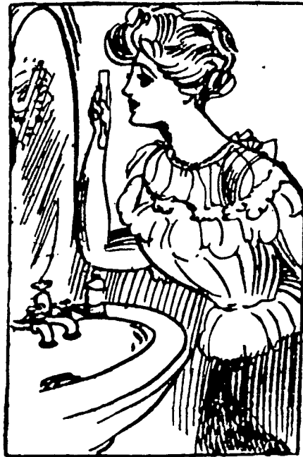
Cleans Both Sides of Teeth.

It is a well known fact that it is an easy matter to keep the outside of the teeth clean, but not so the inside. They are never touched by the toothbrush; in fact, are seldom thought of. Naturally, the inside of the teeth should receive as much care and attention as the outside, and to accomplish this there has been designed the toothbrush shown in the accompanying illustration. It is very peculiar in shape, and would hardly be recognized as a toothbrush. It is made of a hollow tube having attachments at each end for holding the brushes. Two small brushes are placed at each end of the tube and attached to tapes, which connect with a lever. At each